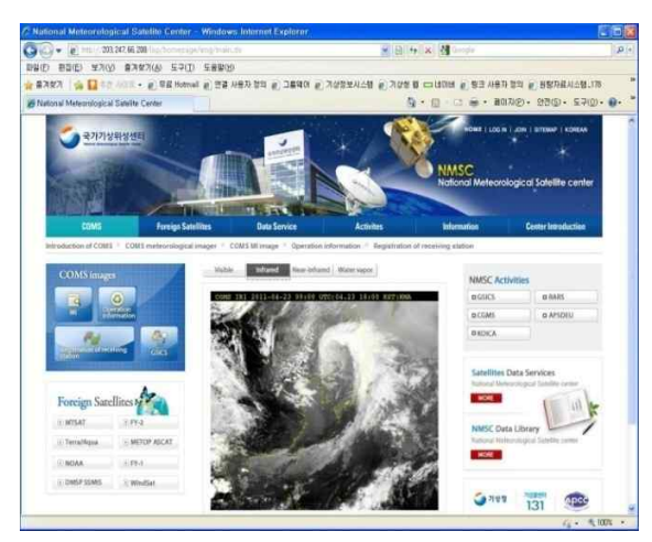
Fig. 2 NMSC website