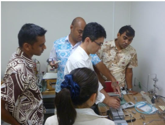
■ Barometer calibration