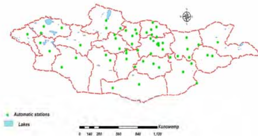
Location of automatic meteorological stations