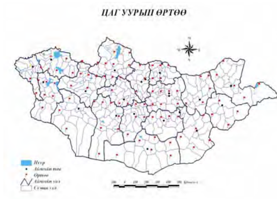
Location of meteorological stations

Currently there are 130 meteorological stations, 186 meteorological posts, 3 upper-air stations in observation network of NAMEM.