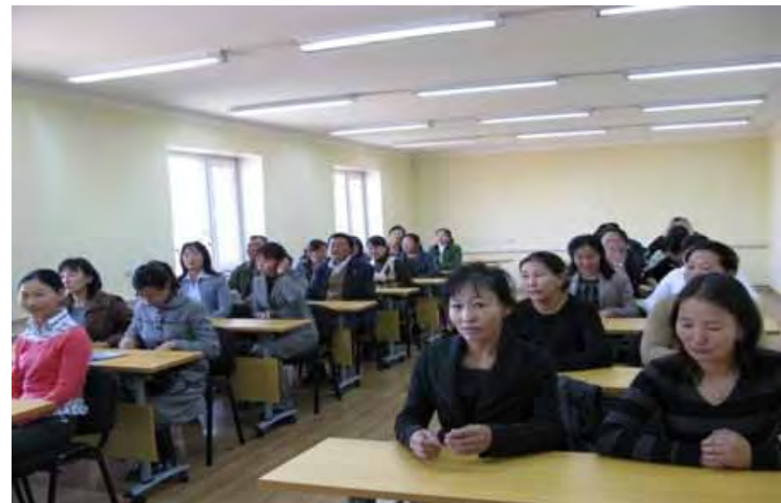
Lecture rooms of the Training center.