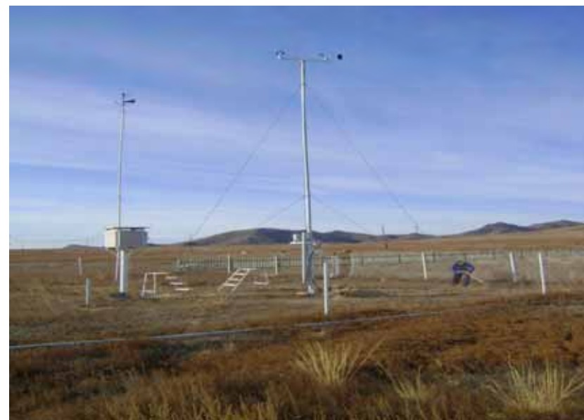
Table 1. number of stations