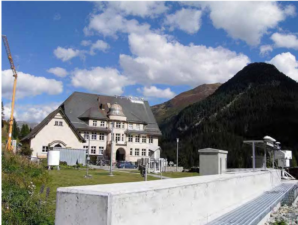
WMO World Radiation Centre (Physikalisch-Meteorologisches Observatorium Davos (PMOD), Switzerland)