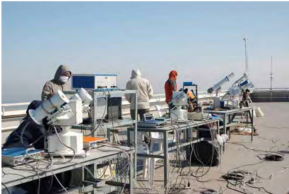
RPC at Mt.Tsukuba in 2007