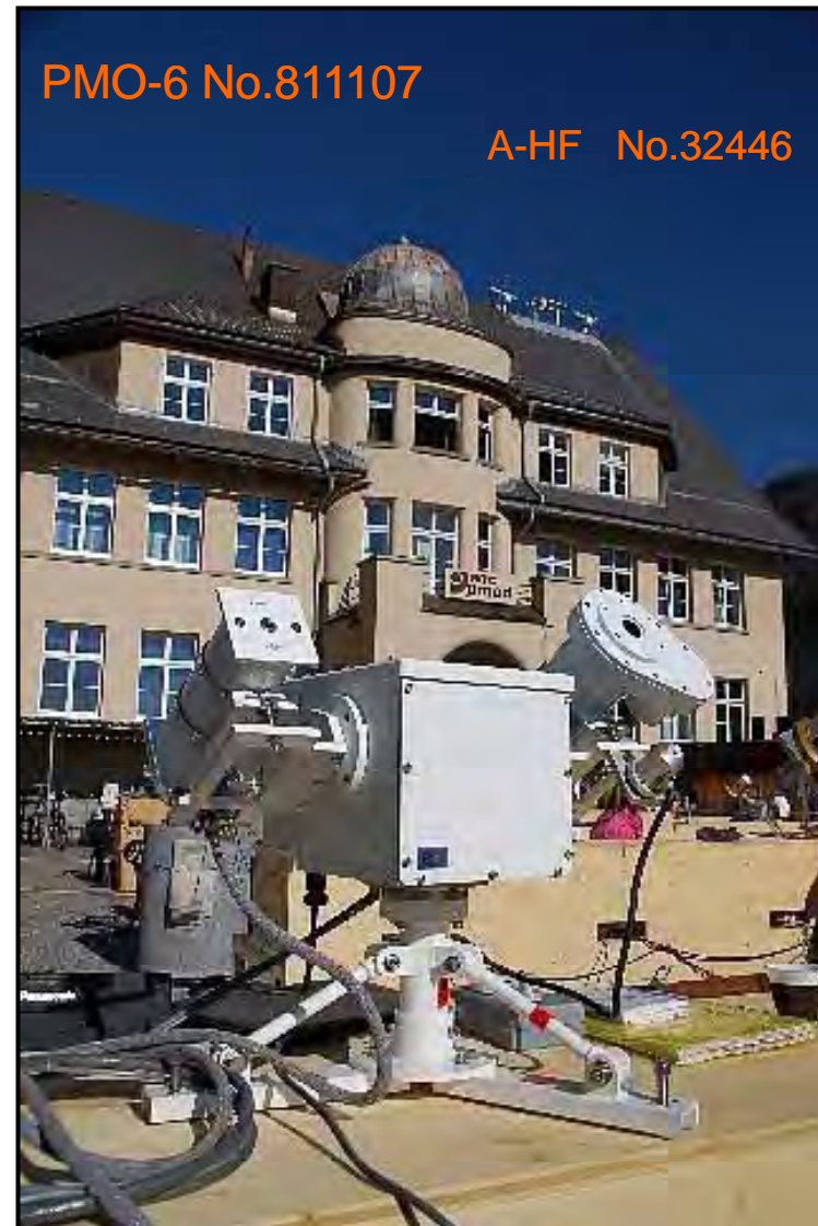
Regional Standard Group at IPC-X (2005)

(JMA has been serving as RRC in the WMO RA II since 1965.)