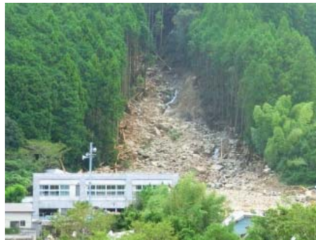
Typhoon Talas (2011)

Examples of catastrophic heavy rains to which the new Emergency Warnings would apply