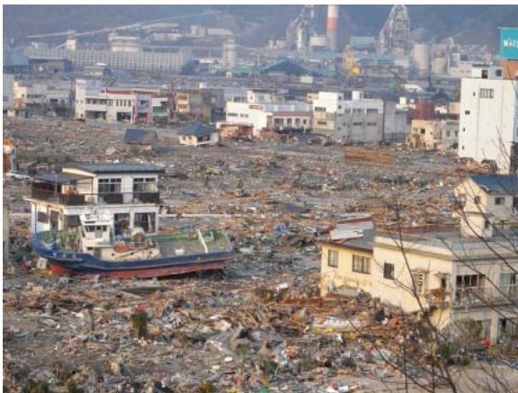
Major tsunami caused by 2011 Great East Japan Earthquake

Examples of tsunami and volcanic eruptions to which the new Emergency Warnings would apply