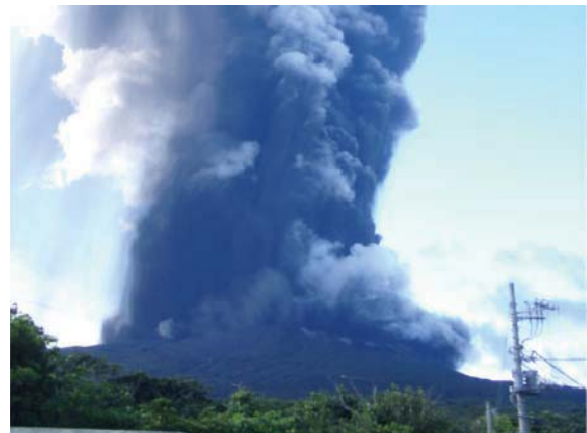
Miyake Island volcanic eruption (2000)

Never let your guard down even if no Emergency Warning is currently in effect.