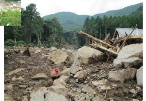
Kyushu-Hokubu heavy rainfall (July 2012)

Note: The criteria for issuance of Emergency Warnings will be determined in response to the views of local governments. As soon as they are determined, JMA will announce them via its website and other media.