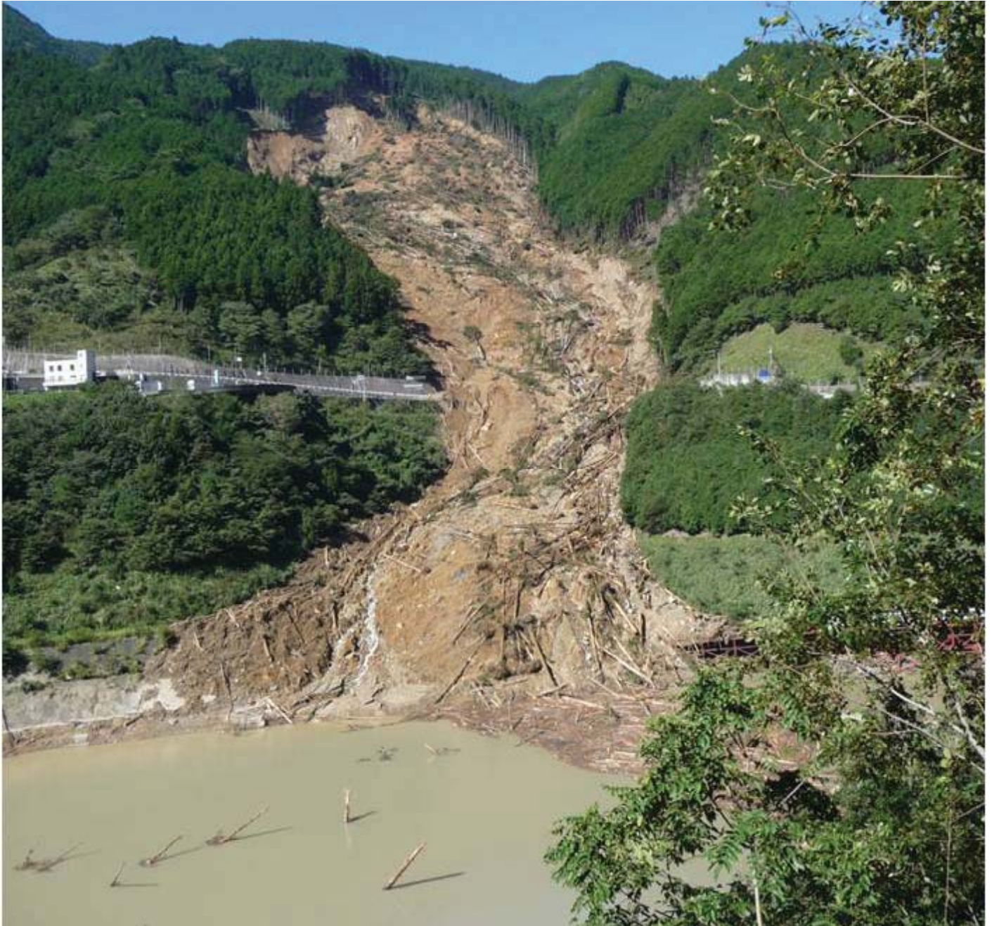
Sediment Disaster caused by the Typhoon Talas in 2011 (Kawakami Village, Yoshino Country, Nara Prefecture)

The Japan Meteorological Agency (JMA) will issue Emergency Warnings to alert people to the significant likelihood of catastrophes in association with natural phenomena of extraordinary magnitude.